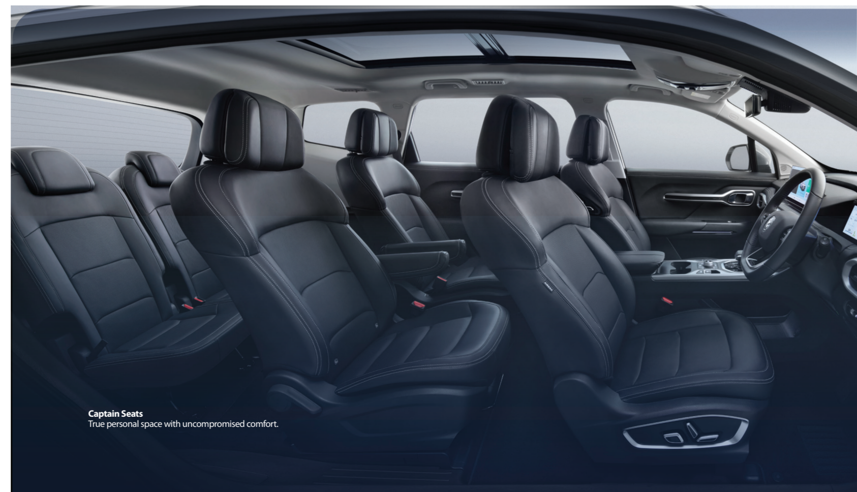
Captain Seats True personal space with uncompromised comfort.