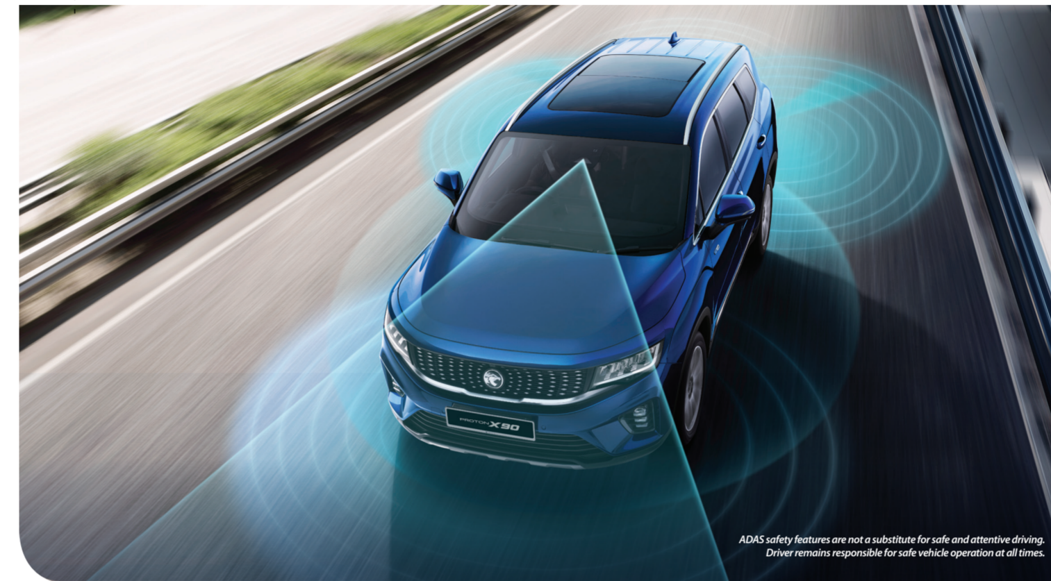
ADAS safety features are not a substitute for safe and attentive driving. Driver remains responsible for safe vehicle operation at all times.