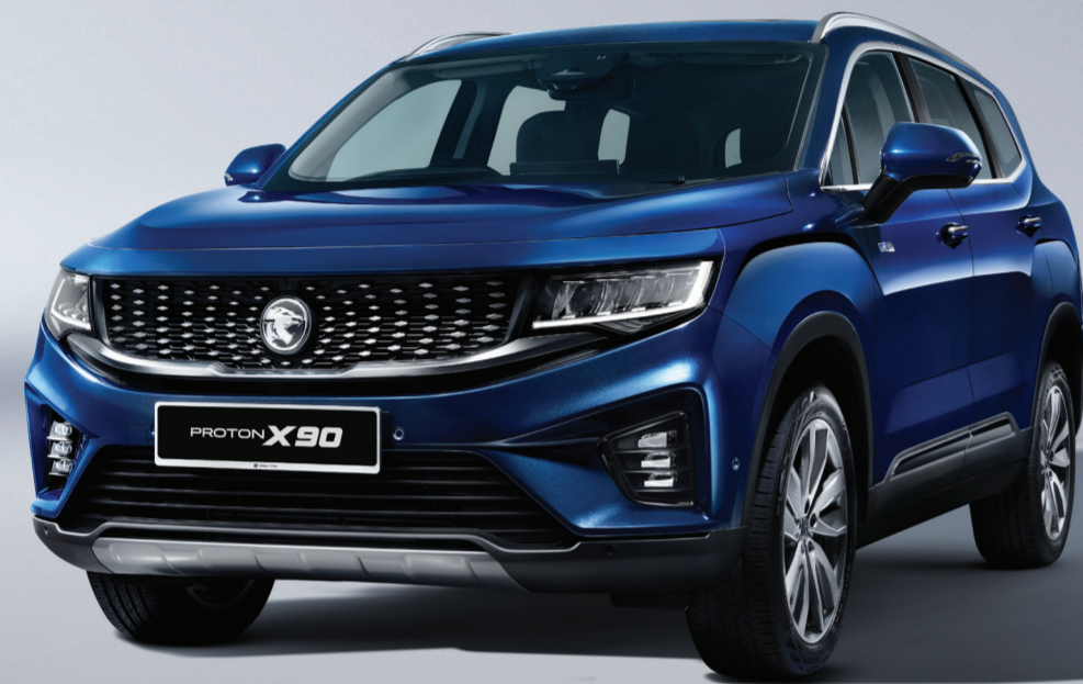
LED Headlamps with Daytime Running Lamps Maximum illumination in all weather conditions with the stylish full LED headlamps and daytime running lamps.